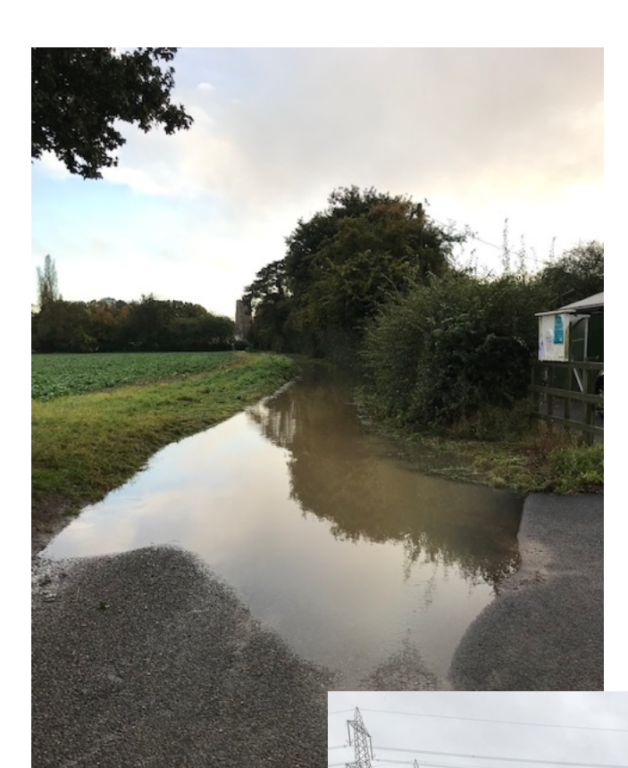
Outside the village hall causing an event to be postponed