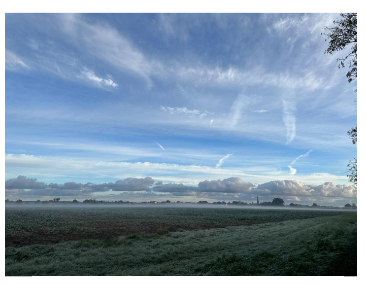
Pettistree on an early morning – and cold – run.

Likely we'll then plant the rest of the fenced-in plot in 2025 once we've figured out what we're doing a little more! It's certainly been a steep learning curve with plenty of things going awry – mainly the deer taking a fancy to the new shoots and persuading us to erect the fencing while the vines get established. Hopefully this will come down in future years when the vines are mature – it will return the vineyard to a more natural look.