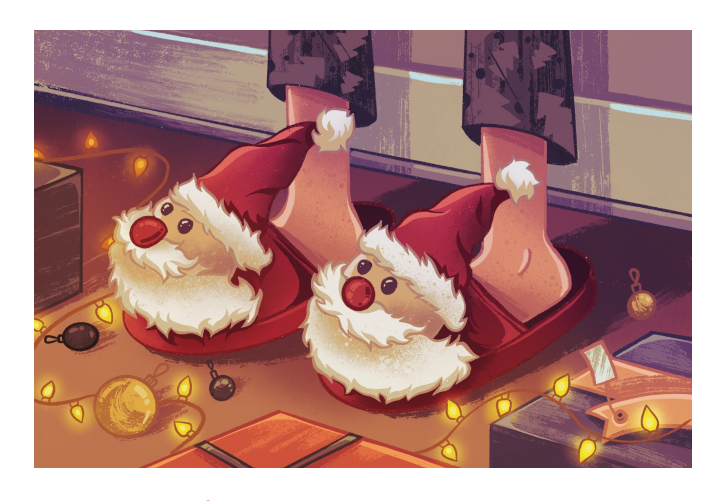
Don't forget to keep your toes warm

A scam: If you get a missed call from a 00 number please be careful as it may be a costly scam. The temptation is to ring back to find out who is calling but you may be ringing a premium line at extremely high rates and to an overseas number. The scammers take a cut from the cost of the call.