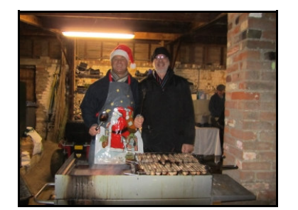
Carols in the barn