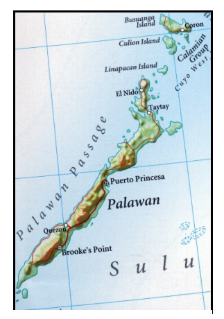
Part of the Phillipine Islands

Chairman and registered charity and and equipment. largest of the in many ways the work of the Trust in