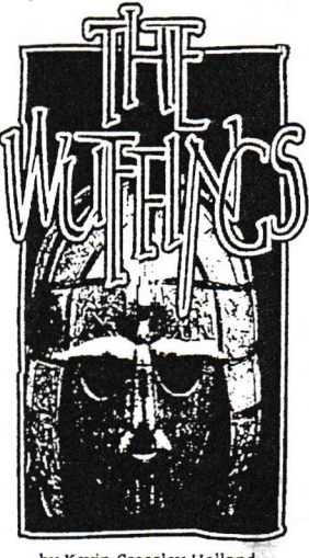
by Kevin Crossley-Holland

TO BOOK YOUR TICKETS OR TO FIND OUT MORE, CALL THE BOX OFFICE TODAY ON 01473 211498